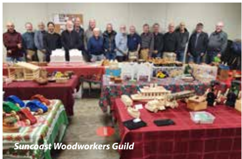
Suncoast Woodworkers Guild