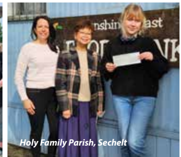
Holy Family Parish, Sechelt