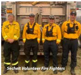
Sechelt Volunteer Fire Fighters