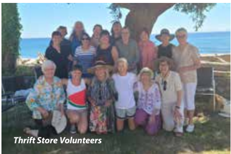
Thrift Store Volunteers