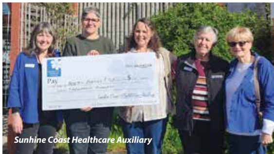
Sunshine Coast Healthcare Auxiliary

Meet just some of our incredible community who supported us in 2023-24.