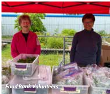
Food Bank Volunteers