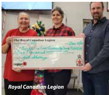
Royal Canadian Legion