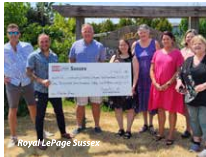
Royal LePage Sussex