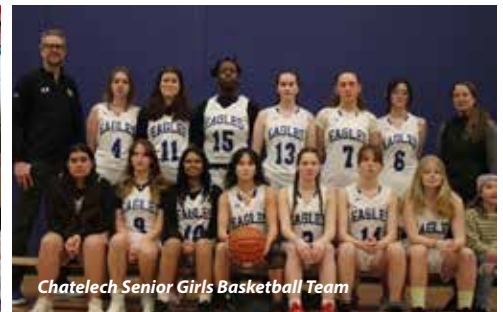
Chatelech Senior Girls Basketball Team

MAKE A DIFFERENCE TODAY! | 604-885-5881 | INFO@SCCSS.CA | VISIT SCCSS.CA