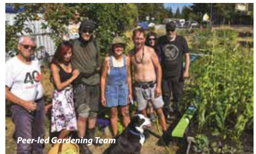
Peer-led Gardening Team