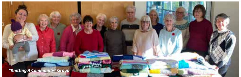
"Knitting A Community" Group